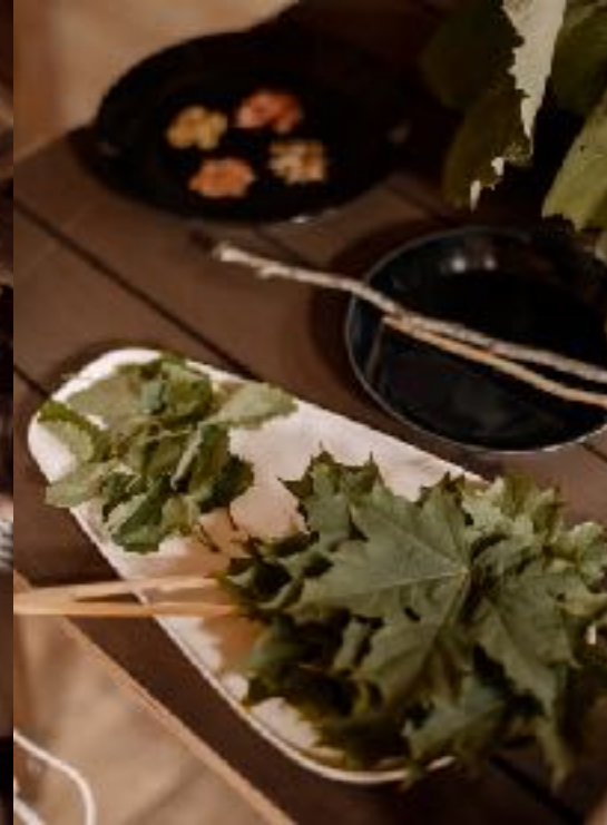
Tea Ceremony & Incense Making Workshop @ Fiskars Art & Design Biennale in Fiskars Village, Finland July 12th - 14th, 2019