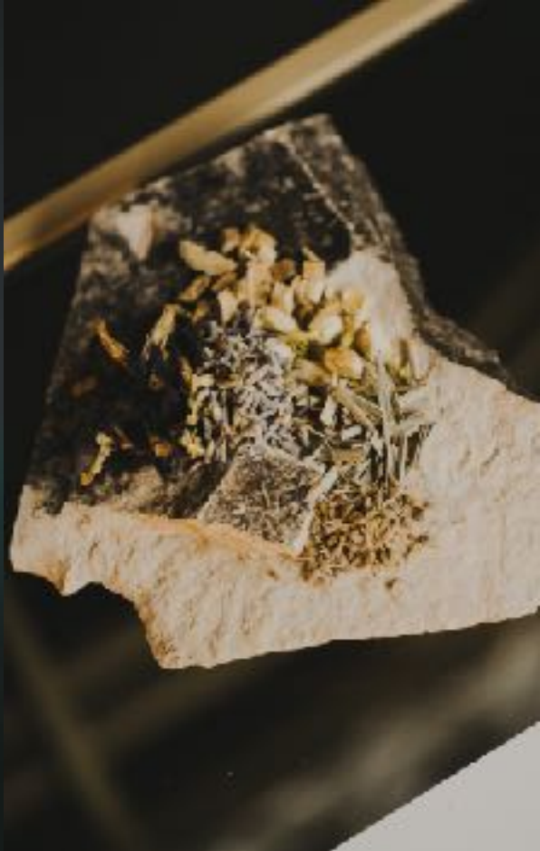
Gold & Silver Tea Ceremony @ Neu-Ulm, Germany October 2022