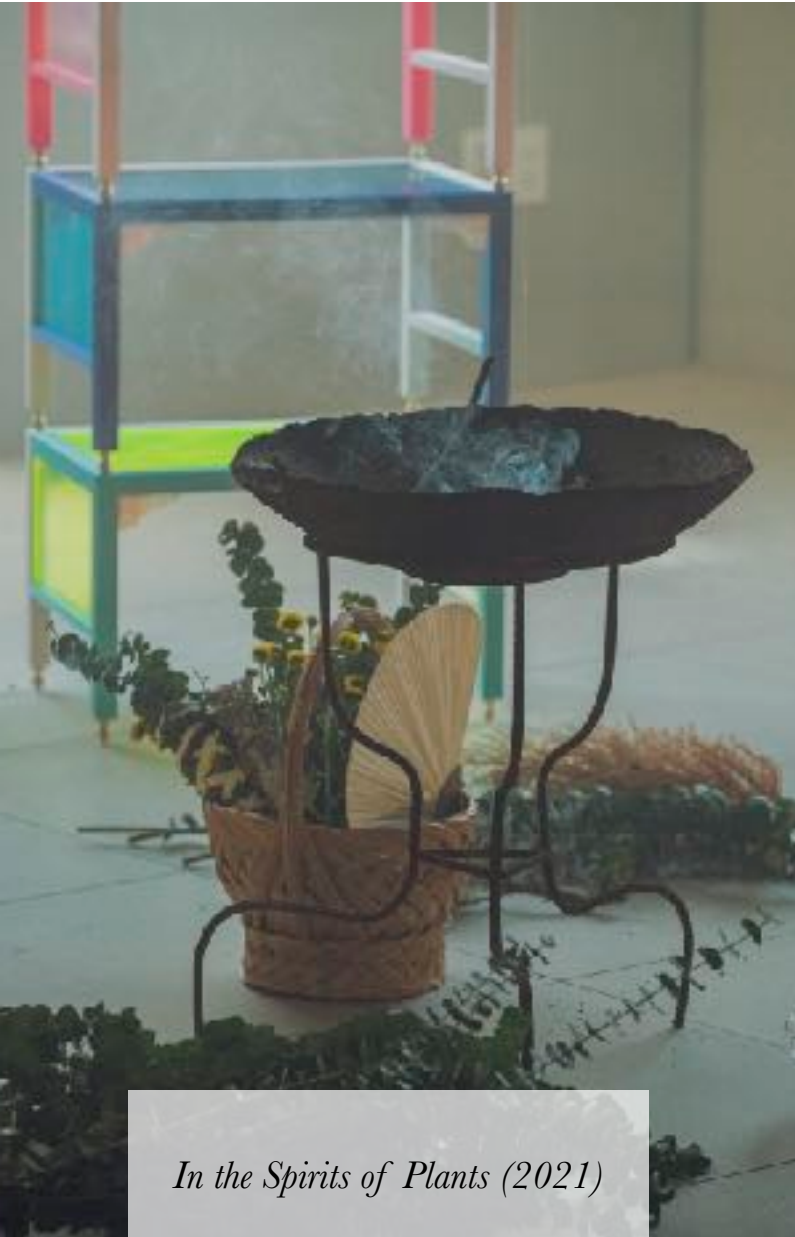
In the Spirits of Plants (2021)