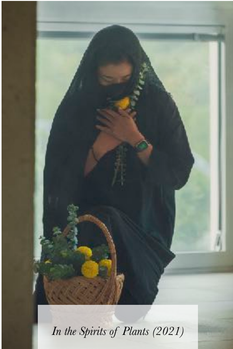
In the Spirits of Plants (2021)