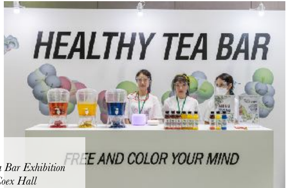
Healthy Tea Bar Exhibition @ Coex Hall Seoul, Korea August 2020