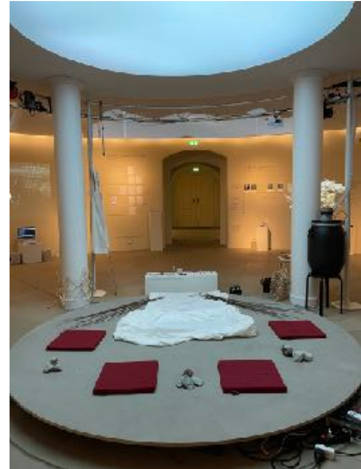
Xenofauna Ceremony with haptic hanbok & artificial cloud machine

@ Tieranatomisches Theater Berlin, Germany January 2022